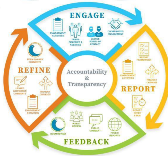
Figure 3. BOEM Stakeholder Communication Approach

Development of the Project within the Lease Area and along the export cable route(s) will occur in several phases including surveys and assessments, design and siting, permitting, construction, operations and maintenance, and decommissioning. The 'adaptive' nature of the FCP will allow it to be updated over time as inputs are received and through different phases of Project development and implementation.